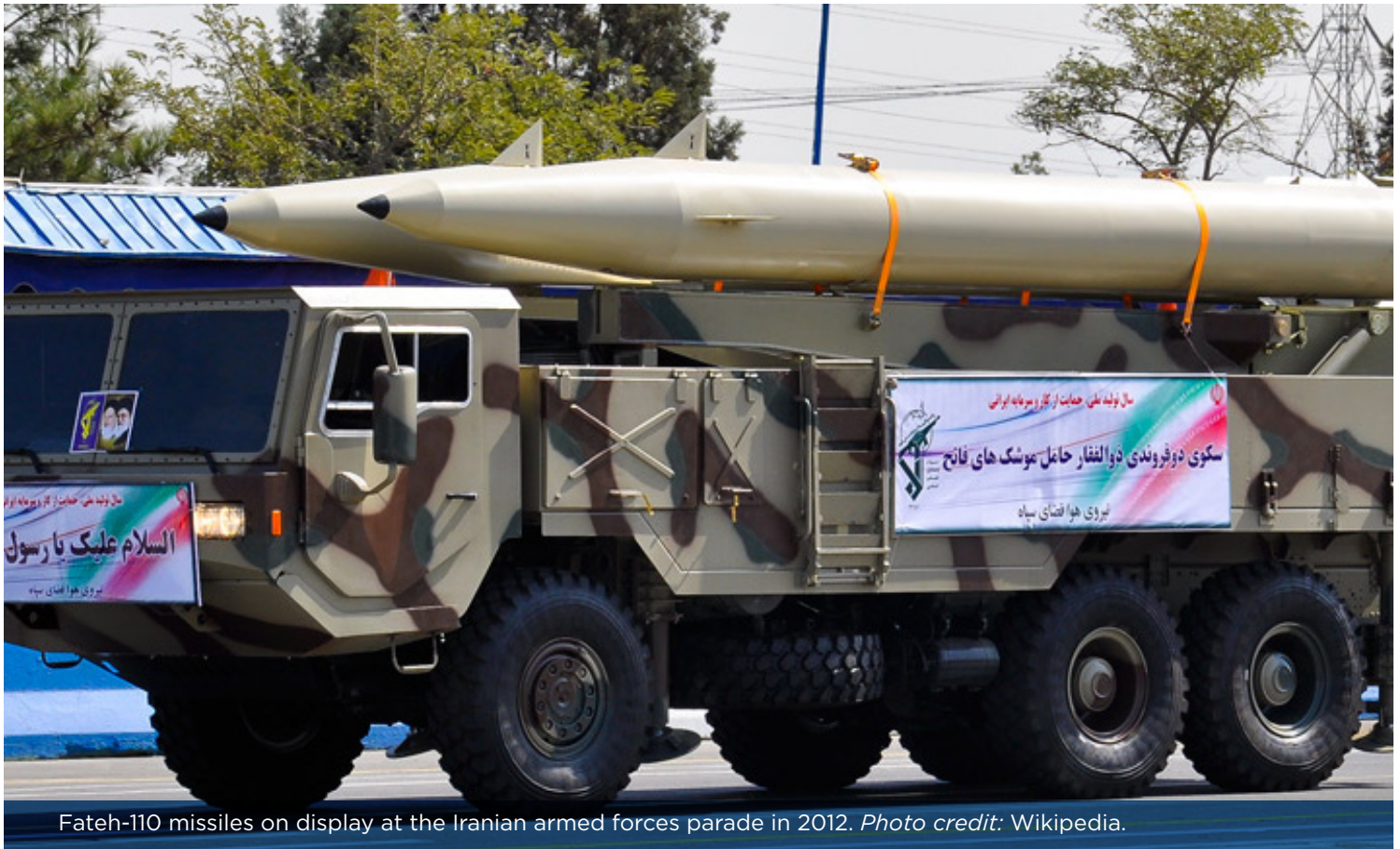
Fateh-110 missiles on display at the Iranian armed forces parade in 2012.

Iran's pursuit of greater precision is best evidenced by the evolution of the Zelzal ( Earthquake ) artillery rocket. The first-generation Zelzal is unguided and terribly inaccurate, with half of the rockets missing the intended target by more than three kilometers. Improvements in Zelzal accuracy were achieved by spin-stabilizing the rocket, though this measure produced modest results.